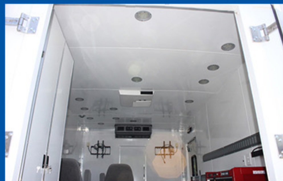
FRP Interior Liner

2940 Dexter Drive Elkhart, IN 46514 (800) 505 2530 - www.mymidway.com