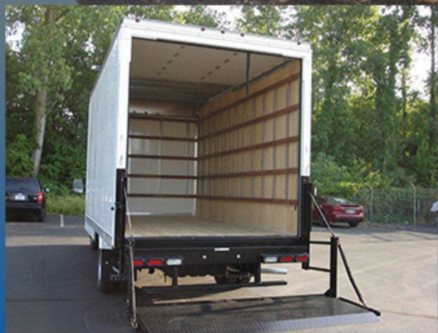
Liftgate & Cargo Control