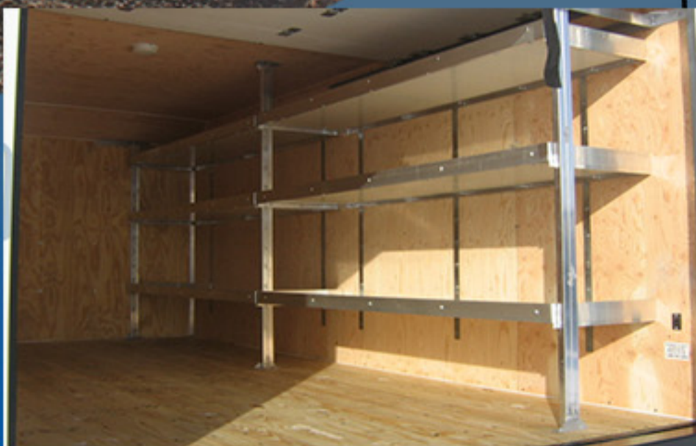
Interior Shelving Options

LED Backup Marker and Stop/Turn/Tail Lights